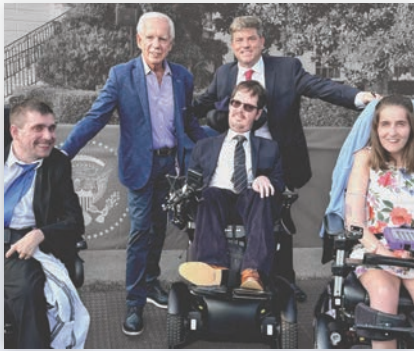
NCCDD Council Members

The Council represents North Carolinians with I/DD and is responsible for carrying out the provisions of the Developmental Disabilities Assistance and Bill of Rights Act of 2000 (DD Act). Serving up to two four-year terms, the membership is composed of 60 percent of people with I/DD or family members, with the remainder composed of representatives from state agencies, nonprofit and professional organizations. The Council guides all initiatives and contracts.