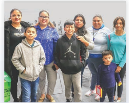
DD Network Partners